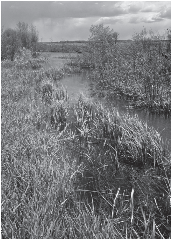
Figure 6. Breeding sites must provide protection in shallow water for unattached as well as attached egg masses. Sunset Prairie, BC. 31 May 2004. (R. Wayne Campbell).

As females enter the breeding waters males compete vigorously by attempting to mount them. Successful males may remain in amplexus (clasped onto the female's back) for over 24 hours. While she lays her eggs the male fertilizes them by depositing sperm onto the globular mass of eggs and into the water. Egg-laying commences from 4 to 6 days after first frogs appear at the breeding grounds. In Alaska, 50 % of the eggs are laid within 2-4 days after the first mass appears, with most being laid in the late afternoon when temperatures peak. The actual egg-laying process may last from 6 to 10 days and adults may vacate the area between 12 and 22 days after arrival. Each year, the chronology of egg-laying varies with region and seasonal extremes of weather.