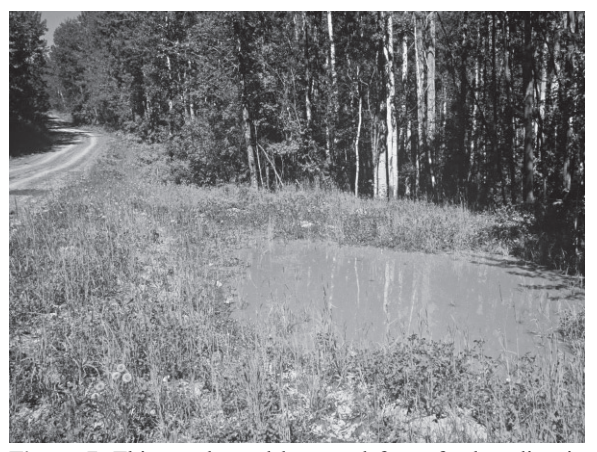
Figure 7. This pond, used by wood frogs for breeding in mid-May, was completely silted by dust from road traffic and was abandoned by frogs in mid-June (near Boucher Lake, BC. 19 June 2004..

It is well known that nonindigenous fishes, as well as other native vertebrates, prey on the eggs, larvae, and adults of many amphibians. This activity is unlikely to impact the wood frog populations because of the semi-permanent and ephemeral nature of its breeding sites. Of concern, however, are chemicals that may be used to remove unwanted fish stocks from a variety of wetlands. Chemical herbicides and pesticides used to manage waterweeds and insect pests to increase recreational fishing opportunities can also greatly impact wood frog populations. Fortunately, many of the newer chemicals have been developed to decompose quickly after application.