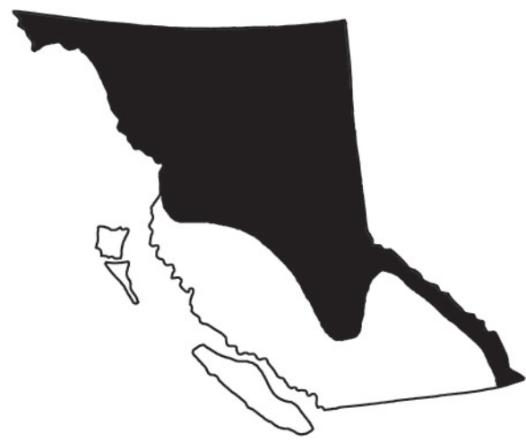
Figure 2. Distribution of the wood frog ( Rana sylvatica ) in British Columbia.

species found throughout most of the interior of British Columbia (Figure 2). Populations vary considerably with latitude but are highest in more northern areas. The centre of abundance appears to be in the southern Peace River region. It ranges from the vicinity of the Alsek River in the extreme northwest and across the northern half of the province south to Terrace, Francois Lake and Prince George in the west. The range continues southeast through the eastern Fraser Plateau and Cariboo-Chilcotin regions to Clinton and Chase and east to Yoho National Park (Figure 3). It has been found at subalpine elevations.