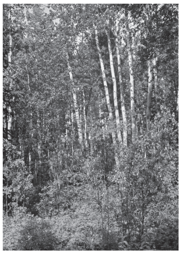
Figure 5. Soon after mating in the early spring adult wood frogs move to terrestrial habitats including trembling aspen forests with a shrubby understory and lots of leaf litter and downed woody debris. Beatton Park, BC. 23 June 1996. R. Wayne Campbell).

animal starts again the full chorus soon follows.