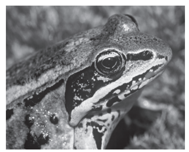
Figure 1. The black facial mask and white jaw stripe are two identifying features of the wood frog ( Rana sylvatica ). Sukunka River, BC. 23 June 2002.

Throughout the central and northern interior of British Columbia the wood frog ( Rana silvatica ) (Figure 1) is the true harbinger of spring. As temperatures rise above freezing and ice begins to melt, masses of wood frogs move at night from the forest where they passed the winter to nearby breeding sites. Almost immediately the males begin their loud mating calls which for a short period can be deafening. Herpetologists call the mating system an "explosive aggregation".