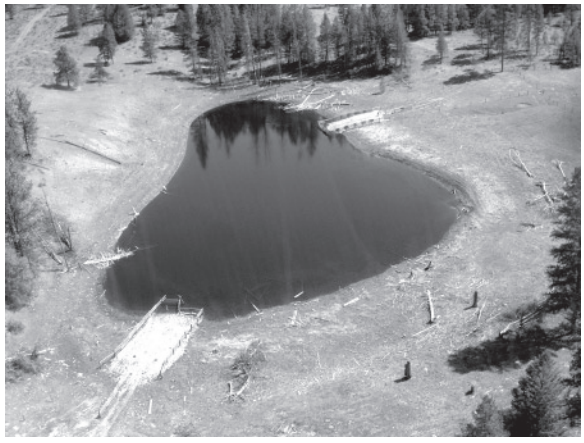
Figure 8. To minimize erosion and protect amphibian habitat at ecologically sensitive ponds, access paths for livestock are used to concentrate drink locations. Rocky Mountain Trench near Cranbrook, BC. 8 May 2004.