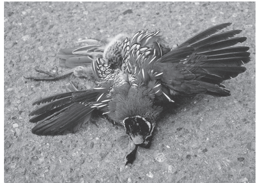
Figure 1. When crossing roads, species such as this California Quail ( Callipepla californica ) often prefer to walk rather than fly. Consequently, upon approach of a fast-moving vehicle, it is not uncommon for them to remain motionless - a natural reaction for these birds in response to predators. Near Keremeos, BC. 11 April 2003.

Height-dependent road crossing success by birds is a challenge to study empirically since most dead birds observed have no associated heights, and the proportion of total birds crossing the road within