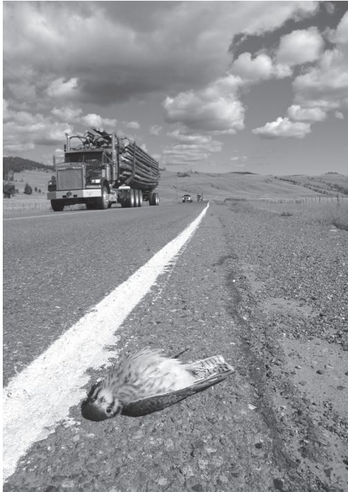
Figure 4. This juvenile American Kestrel, which was probably still learning to forage, met an untimely demise on Highway 5A near Stump Lake, BC. 18 July 2006. (Michael I. Preston).

bellied Sapsucker, whereby lower crossover heights on secondary and gravel roads tended to be more frequent than on primary roads. The Gray Jay, when crossing primary roads, preferentially crossed in height Class 3, compared to lower crossover heights on gravel roads. Differences in crossing heights among road types for these species may be a learned behaviour or an adaptation for reducing collision potential.