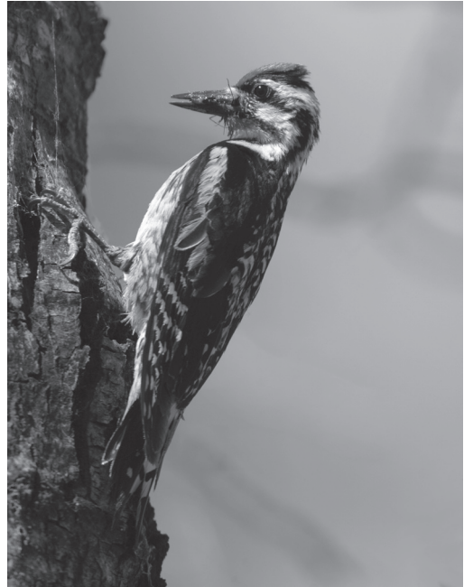
Figure 5. The Yellow-bellied Sapsucker is a common road-crossing species in northeastern British Columbia, especially where nesting occurs near road edges and foraging areas are on the opposite side. Kiskatinaw River, BC. 23 June 2006. (Michael I. Preston).

To our knowledge, there are no studies that have attempted to determine the probability of potential collision of birds with vehicles among different road types. Instead, of the few studies that do report on bird-vehicle collisions, the numbers reported are usually only of dead birds, and not of those that successfully cross. Those dead birds are then commonly presented as the number per unit of distance driven ( e.g. , Banks 1979, Sargeant 1981, Ashley and Robinson 1996) and mortality estimates are extrapolated to much broader geographic areas. From a limited number of studies, Banks (1979) estimated that the total number of birds killed on roads in the United States was highly variable and ranged between 10.7 and 380 million birds per year. The National Wind Coordinating Committee (2001) has since revised that estimate to an average of 80 million birds per year, accounting both for new information from more recent studies, as well as the increased amount of roads and vehicles.