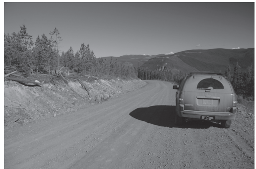
Figure 2. A typical gravel road used primarily for logging and access to gas wells in northeastern British Columbia. Near Kobes Creek, BC. 19 June 2006 (Michael I. Preston).

We determined that on average, birds in Class 1 are susceptible to collision with all vehicles, birds in Class 2 are susceptible mainly to large transportation trucks, and birds in Class 3 avoid collision altogether (Figure 3). While more precise probabilities would require knowing how many unsuccessful crossings versus successful crossings are made, and which vehicle types are involved, our goal is to provide general probabilities based only on crossover heights. Thus, if 100 birds are observed crossing roads, and 25 fly at \leq 1.8 m and the remainder fly > 4.6 m, then we estimate that the probability of potential collision is one in four, or 25%.