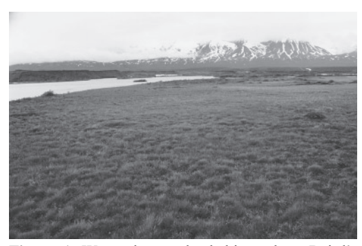
Figure 1. Wet sedge tundra habitat where Baird's Sandpiper was found nesting in 1996. Kelsall Lake, BC. 2 July 1999 (Linda M. Van Damme).

In addition, courting displays, including flights,