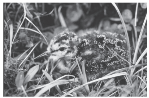
Figure 3. Baird's Sandpiper chick discovered at Kelsall Lake, BC, provides the first documented breeding record for this species in the province. 2 July 1996 BC Photo 3610.

Later that day, at the south end of Kusawak Lake, west of the Haines Highway, another pair of Baird's Sandpipers was observed with one tiny chick that