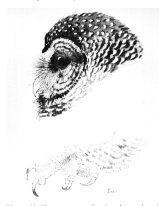
Figure 10. The exact year Allan Brooks purchased the full mount of the Spotted Owl from William Hall is unknown but it may have been in 1908. Permission to reproduce Allan's artwork was received from E.J. Brooks. The drawings also appeared in Laing (1979).

The year and precise date for the mounted specimen purchased by Brooks from Mount Lehman is uncertain. If it was obtained prior to 1903 (see Mount Lehman 1903 below) it would become the first occurrence and breeding record for British Columbia. Laing (1979, p. 78) published artwork by Allan Brooks that shows a side profile of the head and one foot of a Spotted Owl dated circa 1908 that probably represents what Brooks salvaged from the mounted specimen (Figure 10).