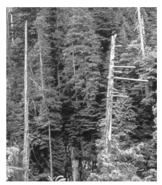
Figure 25. Today it is well known Northern Spotted Owl inhabits late mature to old-growth coniferous forests with remnant snags (bottom), especially with hollow tops, used for nesting. Photo by R. Wayne Campbell, Indian River, BC, 3 October 1987.

<u>Vocalization phenology</u>: There was no early descriptive information on vocalizations at different times of the year or vocal arrays (Bent 1938). These were first described in detail by Forsman (1976), mainly for the breeding period.