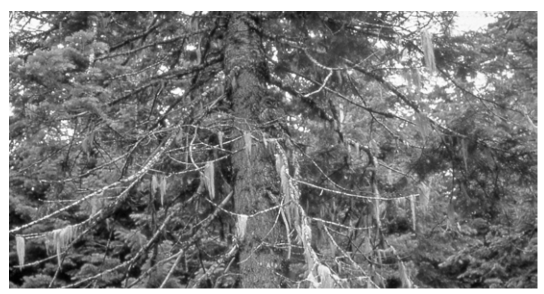
Figure 22. The Northern Spotted Owl noticed by Ray Beckett at Lightning Lake in 1967 was perched on a limb next to the trunk of a conifer tree at the edge of a forest.

Some notable highlights from Delbert's observations on Northern Spotted Owl (Figure 23) in Mount Lehman are summarized below with mention their early significance.