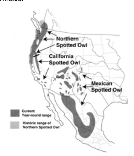
Figure 3. Current breeding distribution of the three subspecies of Spotted Owl in western North America (from Gutièrrez et al. 1995). Permission to reproduce the map was obtained from Birds of North America Online http://bna.birds.cornell.edu/bna, maintained by the Cornell Lab of Ornithology.

Three subspecies of Spotted Owls are currently accepted by taxonomists in North America based on body characteristics (American Ornithologists' Union 1957, Gutièrrez et al. 1995). The Northern Spotted Owl, named by Merriam (1898), is the largest and darkest, the California Spotted Owl, named by Xantus (1859), is intermediate in size and lighter in body colour, and the Mexican Spotted Owl, named by Nelson (1903), is the smallest and lightest brown. The current ranges are shown in Figure 3. The historical range of the northern subspecies includes the southwest mainland coast of British Columbia from Birkenhead Lake and Anderson River south through the coastal mountains and eastern and western slopes of the Cascade Range in Washington and Oregon to northern California (Campbell et al. 1990b, Dunbar et al. 1991, Gutièrrez et al. 1995 Buchanan 2005, Forsman 2006). The other two subspecies, California Spotted Owl and Mexican Spotted Owl, occur inland and are more southerly distributed.