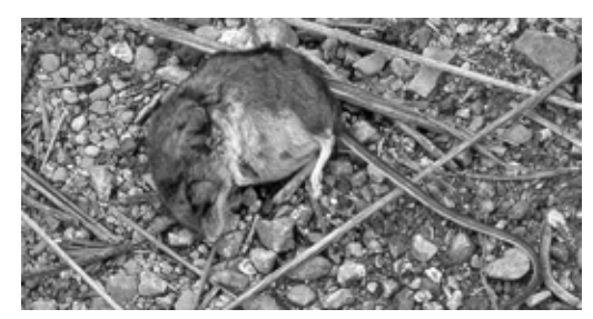
Figure 28. Although a secondary prey source in the diet of Northern Spotted Owl, Delbert Ryder first recorded deer mouse as a food item.

Prey: Delbert's list of prey species taken by Northern Spotted Owl was derived from direct observation, but no pellets were collected and analyzed. On three occasions he noticed an adult male roosting or sleeping with the remains of a Northern Flying Squirrel in its talons and once a male was watched flying to the nest site with a newly killed flying squirrel. He also noted unidentified bird feathers and a deer mouse (Figure 28) in the actual nest cavity. Bent (1938, pages 208-209) does not mention food items. During studies in 1970, 1972, and 1973 in the Oregon Coast Range, Forsman (1976) determined that 41.1% of prey biomass in the diet of Northern Spotted Owls was comprised of Northern Flying Squirrels.