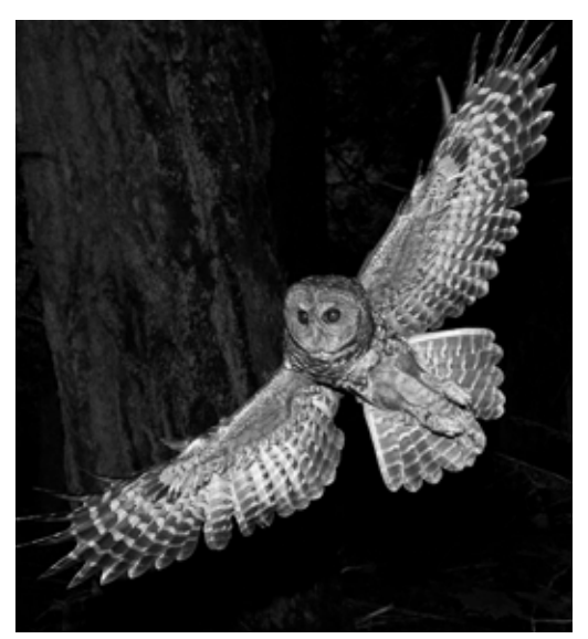
Figure 26. Unlike the more docile Mexican Spotted Owl, Northern Spotted Owl adults often threatened attack by flying close to intruders, not just humans.

Most of their behaviour included bill snapping and scolding but not attacking. Delbert found that when he was climbing trees to check nests the male Northern Spotted Owl often made "close passes" at him but never made contact (Figure 26). Sometimes this happened several time during a visit. Forsman (1976) stated that "Nearly every time I climbed a nest tree [of Northern Spotted Owl] I was attacked repeatedly..."