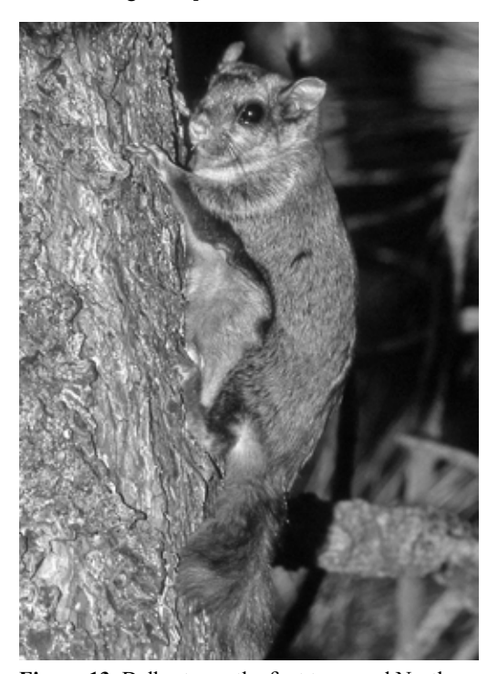
Figure 13. Delbert was the first to record Northern Flying Squirrel as prey for the Northern Spotted Owl. Later, many researchers documented the nocturnal mammal as a primary food item in the owl's diet.

March 22 – the male is seen near the Nest snag but up high in a Cedar tree sleeping with the remains of a squirrel [Northern Flying Squirrel, Glaucomys sabrinus; Figure 13] in Its Talons.