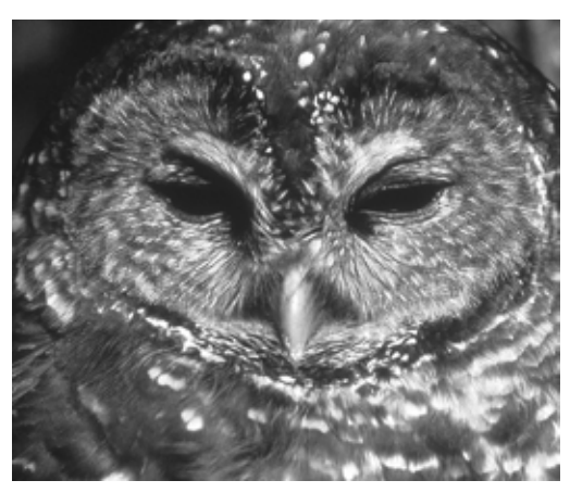
Figure 19. The Northern Spotted Owl collected at Snass Creek, BC, on 9 November 1947 was the last of 12 specimens collected specifically for museum collections.

The location on the specimen label (ROM 81750) and published in Campbell et al. (1990b) is written as 24 km east of Hope. The female was collected by Arthur Peake on 9 November 1947. Ross D. James (pers. comm.), retired curator of ornithology at Royal Ontario Museum, gave a more precise location of Snass Creek (Figure 19).