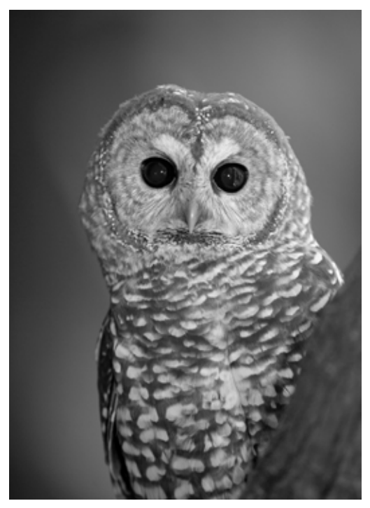
Figure 4. The Spotted Owl was one of the later species of birds in North America to be discovered and named. Its habit of living year-round in the shadowy, dark interior of older coniferous forests, often in canyons and on mountainsides, made finding the bird challenging.

The Spotted Owl (Figure 4) was first discovered in North America in 1858 near Fort Tejon, a former United States Army outpost, situated between the San Emigdio Mountains and Tehachapi Mountains in the Sierra Nevada Mountains in southern California (Xantus 1859). The site is about 56 km south of Bakersfield, CA. Fifteen years later, in 1872, the second record, also a specimen, was taken of a breeding bird near Tuscon, Arizona (Bendire 1892). The discovery of this rare owl prompted a flurry of collecting of specimens and eggs in the early 1900s, especially in California, Arizona, and New Mexico (Forsman 1976). Northern Spotted Owl had not yet been identified.