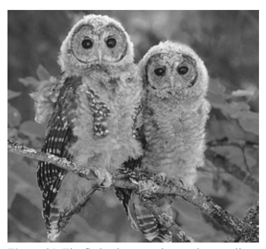
Figure 21. The fledged young observed near Alison Pass, the third confirmed breeding record for British Columbia, were about the size of the owlets in this photograph. The size difference is due to asynchronous hatching of at least three days.

On July 28 Gordon Orians and Christopher Perrins accompanied the author in a search for the owl's nest and for owl pellets. Two fledged young and one adult owl were seen. The young owls were able to fly but were a little awkward in regaining a perch. They had down on their heads and breasts at this time (Figure 21). On July 29 Perrins saw both adult birds."