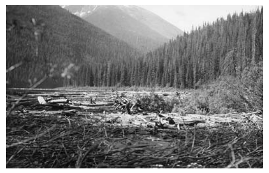
Figure 20. Mature mixed coniferous forests in the western portion of E.C. Manning Park, BC, was the second location (third record) in the province where Northern Spotted Owl was confirmed breeding. A post-breeding adult was found roosting in coniferous woods at Lightning Lake on 16 July 1967. east end of Lightning Lake, BC, 8 August 1952.

(15) E.C. MANNING PARK – Established in 1941, the park has an area of 83,671 ha and is situated in the heart of the northern Cascades Ranges north of the 49<sup>th</sup> parallel. It is 26 km east of Hope. The park is a rugged mountainous area with the western portion having dense mature forests of Douglas-fir, western hemlock, and Western redcedar, potential habitat for Northern Spotted Owl. Early wildlife surveys in the park were carried out during the latter half of the 1940s and early 1950s (Figure 20).