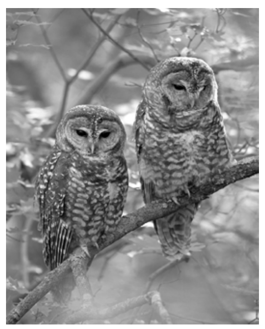
Figure 2. The Mexican Spotted Owl is the smallest and lightest of the three subspecies. Its facial disk and upper breast contain more white and the white body spots are larger than in other subspecies. The Mexican subspecies occurs in the southwest United States south into Mexico.

Wildlife in Canada in the mid-1980s (Campbell and Campbell 1984) and by 2000 the owl's status was confirmed as Endangered in an updated report by Kirk (1999).