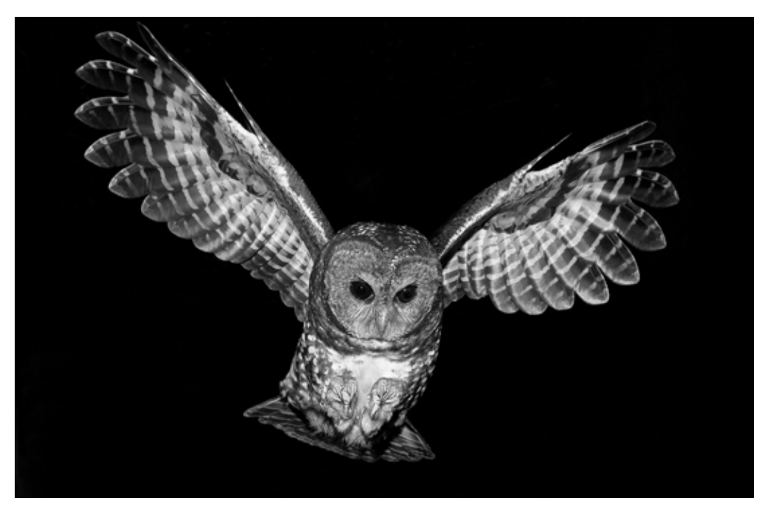
Figure 16. Humans inspecting nests may be attacked by both male and female Northern Spotted Owls, striking the intruder with extended talons.

heard was the female as her voice is higher in pitch than the males. The male then Called back. These vocalizations were heard daily, usually in the period before dawn. When searching for the adults during the day Delbert most often found them roosting or sleeping high up in western redcedar trees.