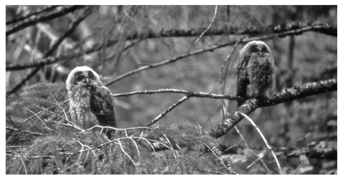
Figure 17. Young Northern Spotted Owls usually leave the nest about five weeks old and both adults care for them for another 60-90 days. Young often roost with siblings not too distant from the adults (Forsman et al. 1984).

July 1 to December 31 – The fledged young were last seen on September 9 and Delbert noted the following day that The Two young are never seen again likely left area for the east woodlands . During the latter half of the year one or two adults were regularly found roosting or sleeping high up (60 feet) in western redcedars under overhanging boughs for protection. They were usually found apart.