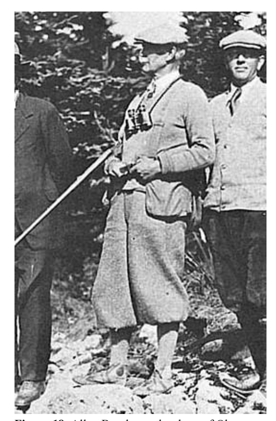
Figure 18. Allan Brooks on the shore of Okanagan Lake, BC, in knickerbockers, circa 1930. Catalogue No. 1562. The Northern Spotted Owl collected near Spuzzum in 1940 is one of the last specimens Allan collected. He died on January 3, 1946 (Laing 1979). His contributions to British Columbia ornithology and stimulating early observation and identification of birds through his artwork are unparalleled.

A female was collected by Allan Brooks (Figure 18) on August 7, 1940 (Campbell et al. 1990b) and deposited in the Museum of Vertebrate Zoology in Berkeley, CA (MVZ 82187).