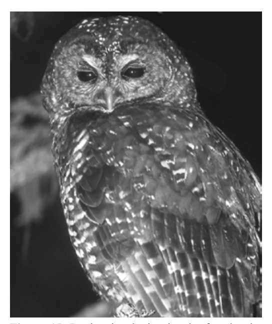
Figure 15. During incubation by the female, the male Northern Spotted Owl usually roosts nearby in a conifer tree.

March 20 to April 22 – While the female was incubating the male roosted nearby in western redcedars and western hemlock trees (Figure 15). The pair called frequently throughout the evening as Delbert noted (2) heard calling just before Dawn. It was the female owl calling for the male to bring her food. On March 27 and April 9, Delbert noted the male was roosting near the nest area with a [Northern] Flying Squirrel in talons.