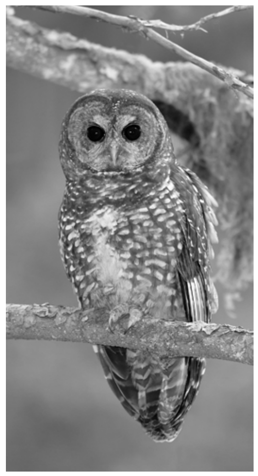
Figure 1. The Spotted Owl was discovered and named over a century and a half ago. Today, it is one of the most-studied owl species in the world, primarily due to conflicts between its habitat requirements of older-aged coniferous forests and the timber industry. The subspecies in this photograph is a Northern Spotted Owl. The plumage of the Northern Spotted Owl subspecies occurring in British Columbia, is darker brown and has smaller white spots than the other two subspecies (Oberholser 1915). It inhabits late mature and old-growth forests year-round from the southwest mainland of British Columbia south along the Pacific coast to northern California.