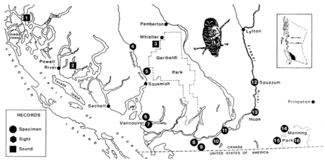
Figure 7. Distribution of Northern Spotted Owl in British Columbia, 1903 – 1965, in three general categories: specimen, sight, and sound. Localities, from north to south and west to east, are: 1. Fawn Bluff (Bute Inlet). 2. Lizard Lake (Lois Lake). 3. Alta/Alpha Lake (Whistler). 4. Upper Squamish River. 5. Cheakamus River. 6. West Vancouver. 7. Vancouver. 8. Mount Lehman. 9. Huntingdon. 10. Chilliwack. 11. Vedder Crossing. 12. Spuzzum. 13. Little Mountain/Hope. 14. Snass Creek. 15. Klesilkwa Creek [River]/McNaught Creek/ Skagit River (Valley). 16. Manning Park (Pinewoods, Allison Pass, Lightning Lake).

(1) FAWN BLUFF (BUTE INLET) – Located on the southeast end of Bute Inlet about 80 km north northwest of Powell River (10U 354465E 5594012N). In his field diary Laing (1936b) wrote: