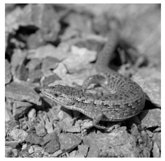
Figure 8. Early collectors did not have access to detailed maps to identify features of a landscape such as a small lake, stream, or headland. Often unknown sites were named for an animal seen such as a Northern Alligator Lizard ( Elgaria coerulea ), which occurs in suitable habitats surrounding Lois Lake on the Sunshine Coast.

The precise location for records (1) and (2) of owls heard calling is unknown and is not described in Laing's field notes. Kenzie Lake is not gazetted by British Columbia Geographical Names and Lizard Lake (49° 51' 00" N, 124° 14' 00" W) has been rescinded and renamed Lois Lake (49° 05' 57" N, 124° 14' 12" W). Lizard Lake was a local name likely attributed to the presence of Northern Alligator Lizard ( Elgaria coerulea ) inhabiting rocky bluffs and clear-cuts around the lake (Figure 8).