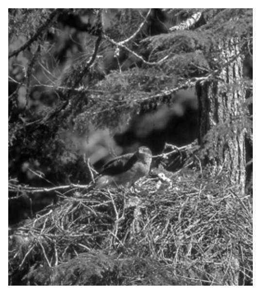
Figure 29. Although Northern Goshawk is known to prey on juvenile Northern Spotted Owls, one pair nested in the old-growth forests at Mount Lehman near nesting owls without apparent incident in 1903 and 1904.

both adults near their nest and on July 2 four fledged young were counted. By July 9 only an adult male was seen and remained in the forest until at least