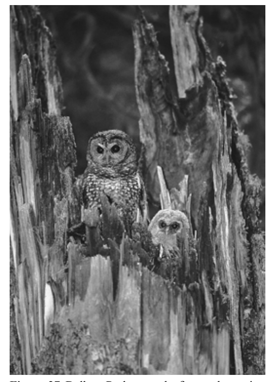
Figure 27. Delbert Ryder was the first to determine that young Northern Spotted Owls leave the nest when about five weeks old.

Nestling period: Forsman et al. (1984) give the nestling stage (hatching to leaving the nest) as generally between 34 and 36 days old. Delbert's observations gave a period of 32 days in 1903 and 37 days in 1904. Young leave the nest over several days sometime between mid-May and the end of June (Gutièrrez et al. 1995; Figure 27). Delbert first noticed young out of the nest on 23 May in 1903 and on 31 May in 1904.