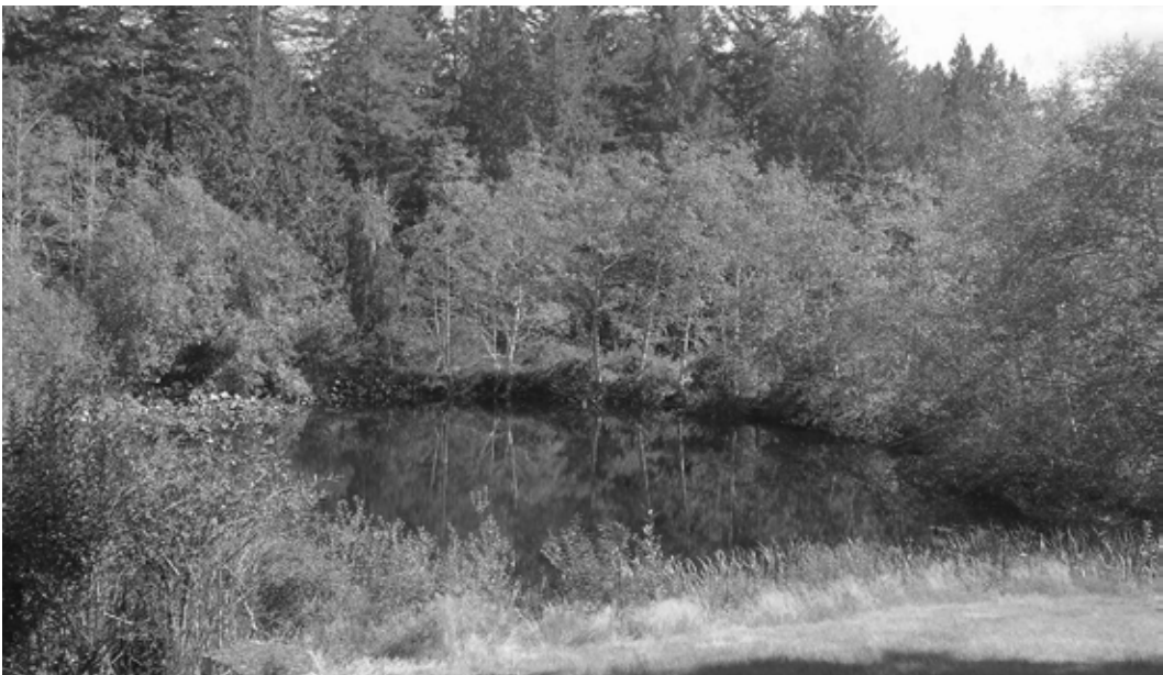
Figure 3. The cumulative impact of small wetlands in British Columbia for migratory, breeding, and wintering water birds is significant. This half-acre pond on private property on Salt Spring Island hosts a wide variety of aquatic plants and animals.

The pond's builder brought Stickleback ( Gasterosteus sp.) fish to the new pond from another Salt Spring Island pond. All other pond animals arrived naturally. Invertebrates include dragonflies, caddis flies, and snails. Pacific Tree Frog ( Pseudacris regilla ), Red-legged Frog ( Rana aurora ), and Rough-skinned Newt ( Taricha granulosa ) use the pond. Among mammals, Northern Raccoon ( Procyon lotor ), Northern River Otter ( Lutra canadensis ), and American Mink ( Neovison vison ) are potential waterfowl predators; the first is an abundant resident, the other two are occasional visitors. Canada Geese ( Branta canadensis ), which mildly bully Hooded Mergansers (to which the ducks pay little heed), nest at the pond and often visit all year. Wood Ducks ( Aix sponsa ) feed on the pond frequently (Figure 4), especially in spring and summer, laying eggs in a duck box about one year in four. Ring-necked Ducks ( Aythya collaris ), Common Goldeneye ( Bucephala clangula ), Barrow's Goldeneye ( Bucephala islandica ) and Buffleheads ( Bucephala albeola ), whose diets overlap that of Hooded Mergansers, visit daily in