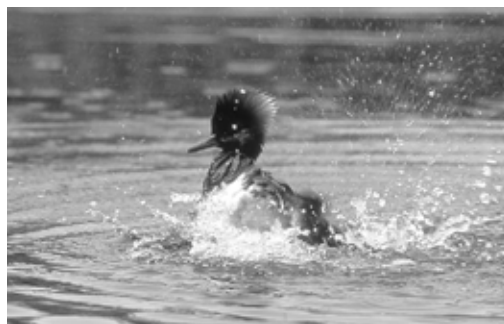
Figure 5. Prior to flying to the nest box, the female Hooded Merganser bathes vigorously. Photo by R. Wayne Campbell, May 18, 2001.

Females at our pond start incubating as early as April 6 and as late as May 10. Nest attendance increases abruptly to 3 to 5 hours at a time. Males loaf or feed, periodically spending some minutes swimming slowly under the nest cavity. During the first half of incubation hens end an incubation session by flying from the box onto the pond, joining the male. Occasionally the pair flies together toward St. Mary Lake (less often toward Trincomali Channel). Male and female then come back to the pond. The female bathes vigorously for 5 or 10 minutes (Figure 5) and flies into the nest cavity. When incubation is 2 to 3 weeks along the hen flies directly from the box to the St. Mary Lake or Trincomali Channel without landing on the pond; she returns the same way. The male doesn't come to the pond at all, or only briefly after accompanying its returning mate. The male probably needs a bigger body of water while moulting. His