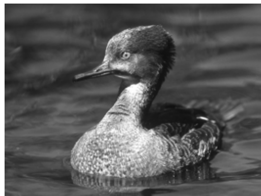
Figure 6. Ducklings hatched on the farm pond mature to juveniles on St. Mary's Lake after a perilous 1.6 km trip through the forest. July 20, 1997.

I am intrigued by the long hikes broods take between our nesting pond and either St. Mary Lake or Trincomali Channel, about 0.87 and 0.77 km away respectively. The ducklings must be very strong to make the trip. Perhaps the relatively long interval between egg depositions allows females to pack nutrients into an egg, and the long incubation period typical of the species assures duckling maturation (Figure 6).