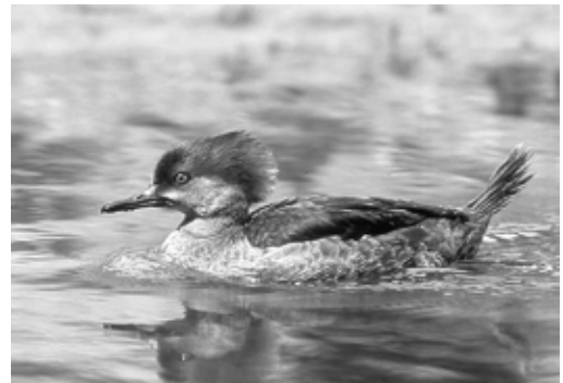
Figure 2. The adult female Hooded Merganser selects the nest site, constructs and maintains the nest, incubates the eggs, and raises the young. Males abandon females shortly after the start of incubation (Mallory et al. 1993). Photo by R. Wayne Campbell, May 18, 2001.