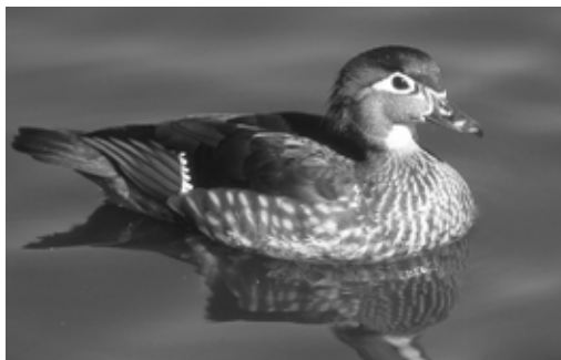
Figure 4. Wood Ducks breed occasionally on the pond, competing with Hooded Mergansers for the two nest boxes available. Photo by R. Wayne Campbell, April 1, 1997.

winter, ranging in numbers from 1-20. Great Blue Herons ( Ardea herodias ) and Belted Kingfishers ( Megaceryle alcyon ) come often, mostly from October through April. They, too, may compete with the mergansers for food, but in both species potential food competition is lessened because first-comers chase off late-arriving conspecifics.