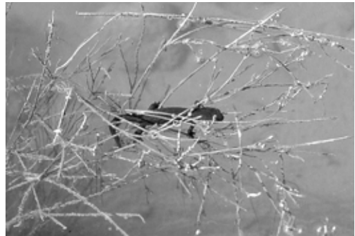
Figure 7. In British Columbia, the only other known predator of Rough-skinned Newt is the Common Garter Snake ( Thamnophis sirtalis ), which seems resistant to the toxic secretions of the newt's skin (Green and Campbell 1984). Newts frequently cling to vegetation in a pond where they are vulnerable to foraging Hooded Mergansers. Photo by R. Wayne Campbell, June 30, 2001.

Watching Hooded Mergansers thrash the mucus from Rough-skinned Newts ( Taricha granulosa ; Figure 7) before eating them, I wonder whether this amphibian, a species of special concern in British Columbia, might be a loser for my encouragement of the ducks. As well, Red-legged Frogs and Pacific Tree Frogs, the former a species at risk, live in our pond and are potential merganser prey. Nymphs of two dragonflies (Blue Dasher [ Pachydiplax longipennis ] and Western Pondhawk [ Erythemis collocata ]), likely merganser food, are found locally and are officially at risk. Close study may reveal more examples. Biologists designing local duck-box projects need to know their aquatic communities well and be ready to make difficult conservation judgments. †